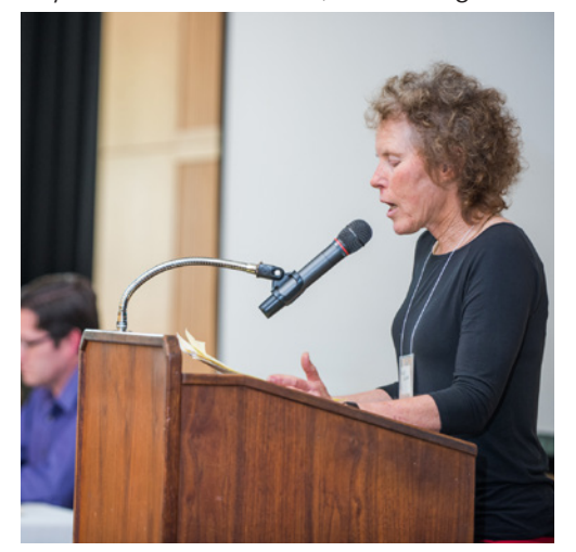
rights questions to the audience.

Food Summit 2016 was a resounding success! Thank you to our Prepared Foods Department (Deli & Bakery) for making the food for the day and our Outreach Department for coordinating and serving it! New Directions was there to help too. Feedback from participants follows two main themes: "the food was excellent!" and "The Co-op makes me proud to be a member!" Food Summit 2016 was hosted by the Humboldt Food Policy Council, of which the Co-op has been an active member for many years, and falls in line with our Strategic Plan goals of Developing Our Local Foodshed. Thank you to everyone who made the event possible! Many local vendors contributed fabulous food for the day, including Alexandre Farms, Arise Bakery, Beck's Bakery, Cypress Grove Chevre, Drake's Glen Chocolate, Dick Taylor Craft Chocolate, Earl's Organic Prodcue, Little River Farms, and North Coast Co-op.