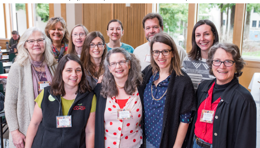
Special thanks to the Food Summit 2016 planning committee! These Humboldt Food Policy Council members spent the better part of a year designing, coordinating, and in some cases their organizations sponsored the event.