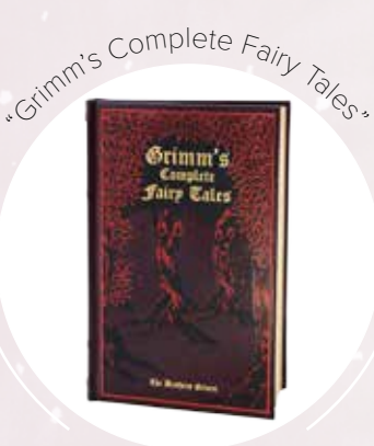
An elegant classic that is leather-bound