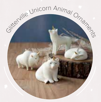
Hand-painted and gold leafed