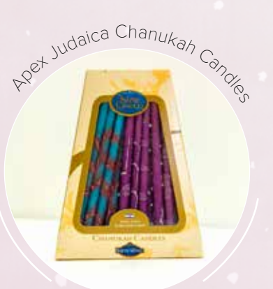
Hand-crafted and hand-dipped with lead-free wicks in Israel