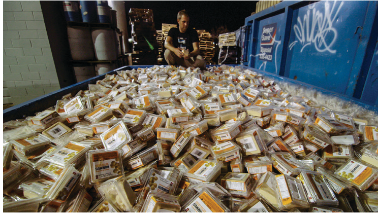
From the documentary "Just Eat It"

The Member Action Committee is an advisory committee to the Board of Directors and is open to all Co-op member-owners. In addition to continuing the