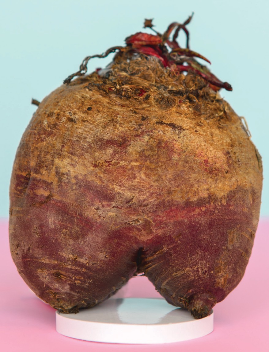
According to the EPA, the best opportunity for preventing food waste is at the source.

About 30 percent of produce from farms won't be the right size or color, or it might have blemishes, scars, scratches, fungus, or spiders.