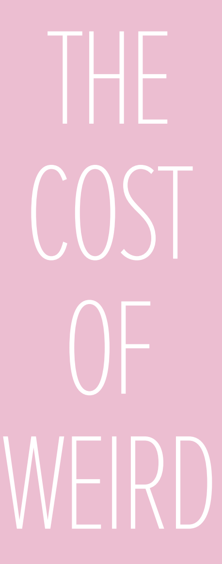
By Zev Smith-Danford, Graphic Design Coordinator

People have been proven to purchase product that is more visually appealing. But in a time when 46 percent of fruits and vegetables never make it from farm to fork for aesthetic reasons, contributing to 25 percent of methane emissions in a country where one in ten people experience food insecurity, it may be time to rethink the way we perceive food.